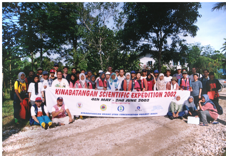
Figure 5 Participants on a 2002 project expedition to the Kinabatangan River

This project contributed to the conservation of a) a highly threatened and iconic species, and b) habitats of exceptional biodiversity value. It had direct relevance to CBD articles 6, 7, 8, 12, 13, 15, 16 and 17 and to the Malaysian National Policy on Biodiversity objectives iii, iv and v and strategies 1, 2, 7, 10, 13 and 14.