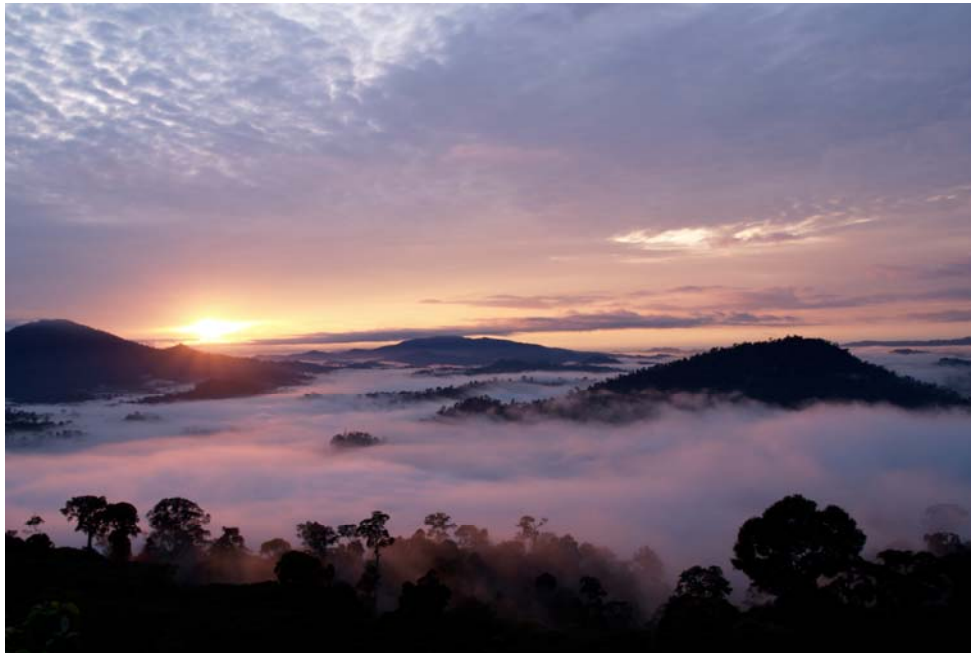
Figure 10 Sunrise over the Ulu Segama Forest Reserve

Consideration might also be given to means by which results from the Sabah-based Darwin Initiative projects could be synthesised and disseminated in a form that would be accessible to conservationists, forest managers and land-use planners in Sabah and the wider region. It would be particularly valuable to develop an evidence-based toolkit for decisions relating to the conservation and rehabilitation of forest fragments and the value of retaining even highly degraded logged forest – especially in the face of continued and rapid land use change in SE Asia.