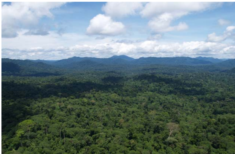
Figure 8 Logged forest of the Ulu Segama Forest Reserve

Darwin project 9-016 and associated research involving KOCP/Hutan made a particular contribution to the protection of this area by demonstrating its critical importance as a habitat for orang-utan. It is estimated that over 4,500 orang-utan live in the Ulu Segama and Malua Reserves, representing almost 1/3 rd the total population remaining in Sabah (Acrenaz et al. , 2005).