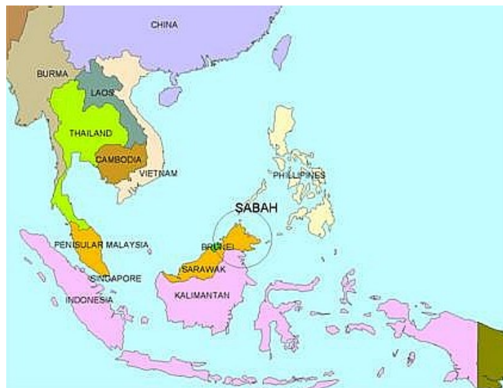
Figure 1 SE Asia with Sabah highlighted

Sabah covers a total area of approximately 74,000 km 2 (Figure 1). It is the eastern most state of Malaysia and occupies the northern portion of the island of Borneo.