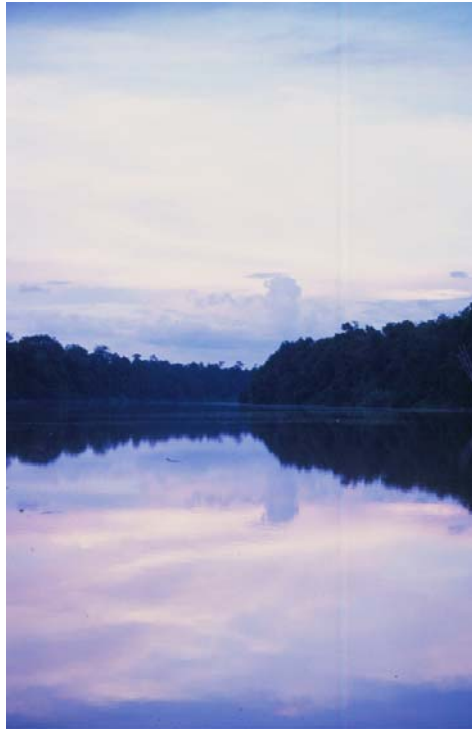
Figure 9 The Kinabatangan River at dawn

In collaboration with the Sabah Wildlife Department and various conservation NGOs, particularly KOCP and WWF-Malaysia, project 9-016 underscored the need to formalise the protection of the lower Kinabatangan, especially in view of the 1,000+ orang-utan and several other high conservation value species that inhabit the area.