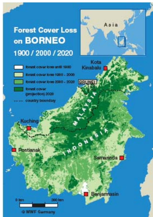
Figure 2 Forest cover & projected loss on Borneo 1900 – 2020

Until the mid-20 th century Sabah remained almost entirely forest covered, with only small-scale clearance and low-intensity timber harvesting associated with coastal and riverside communities (MacKinnon et al. , 1997). However, with the mechanisation of the timber industry in SE Asia following WWII, the rate of exploitation of the lowland rainforest of Borneo increased dramatically. The timber industry on Borneo, concentrated primarily in Sabah and Sarawak, reached its destructive peak in the 1970s and 1980s when the volume of timber exported from Borneo alone exceeded all exports from south/central America and equatorial Africa combined (FAO, 2001).