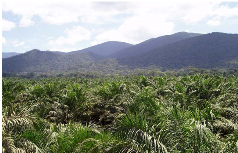
Figure 6 Fragmentation of forest following clearance & conversion to oil palm plantation

Data gathering and capacity building to assist conservationists, ecologists and forest managers in Sabah with promoting responsible economic growth that maximises the development of agriculture and silviculture whilst minimizing the impacts of loss and fragmentation of rainforests on biodiversity. This will be achieved by providing clear practical advice on the size and placement of forest patches necessary to preserve species richness and genetic diversity; and assisting conservationists in establishing priorities for the conservation of species by using genetic techniques to identify butterfly species of high conservation value and determine their vulnerability to habitat fragmentation. The project will focus on butterflies, which are highly diverse in Sabah with many endemic species.